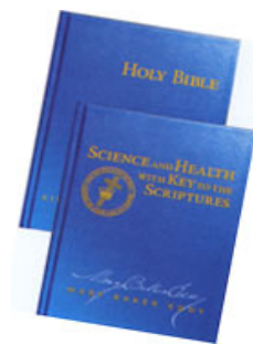
King James Bible and Science and Health with Key to the Scriptures

Your prayer is a powerful and effective aid. It can help keep people safe... in Athens – or in any part of the world.